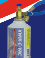
Line Set Flushing Kit