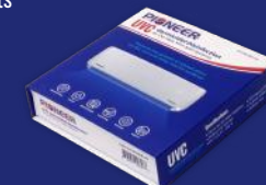
UVC Bacterial Disinfection Kit