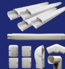
Line Cover Kit