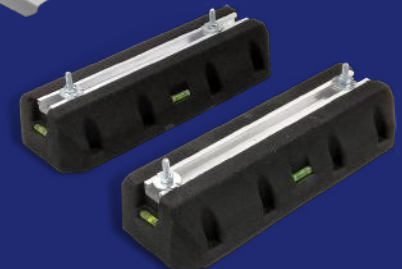
Floor Mounting Base Kit