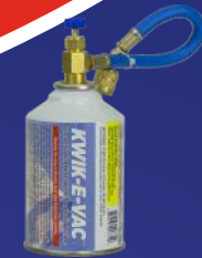
Line Set Flushing Kit